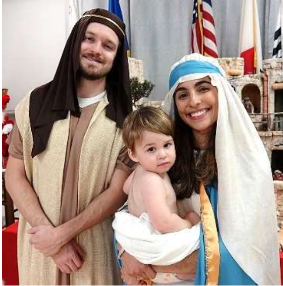
“Joseph”, “Jesus”, & “Mary”