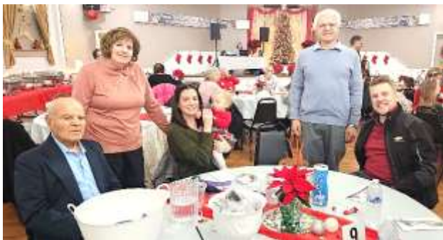
The Muscat family