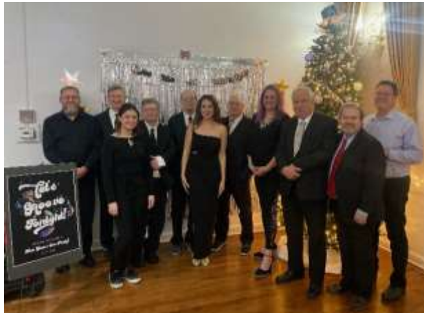
New Year's Eve 2023, with me in the center

I am proud to represent my family and the community. I always want to see my grandparents smiling. They sacrificed so much in their lifetime and I believe I owe them as much thanks as I can give.