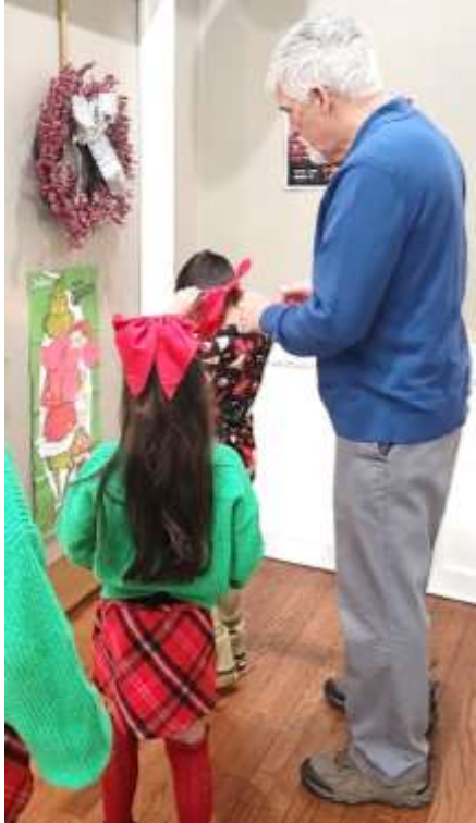
Pin the heart on the Grinch