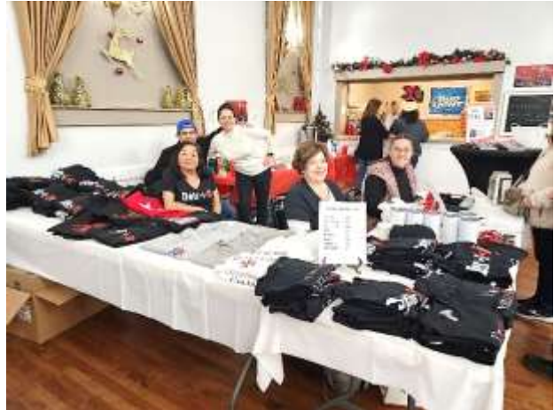
MACC Maltese merchandise