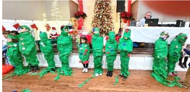
All of our Christmas trees