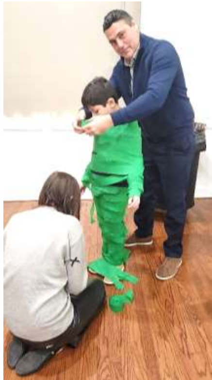
Everyone had five minutes to wrap someone like a Christmas tree