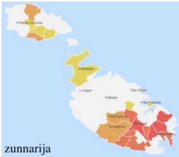
Distributions of the words zunnarija (above) and zfunnarija (below)