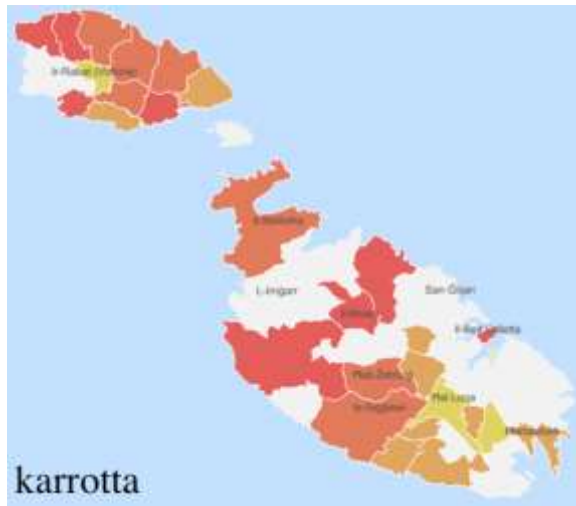
Distributions of the words karrotta (above) and karrottu (below)