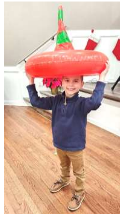
Mexican hat dance?