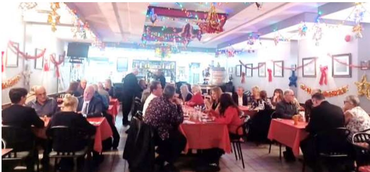
See pages 12-13.