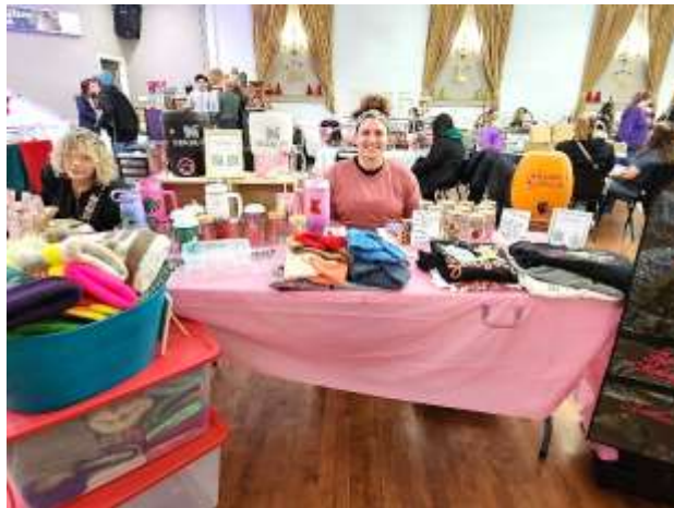
Korkosini Creative Custom Designs