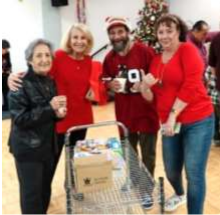
Some of the adults present