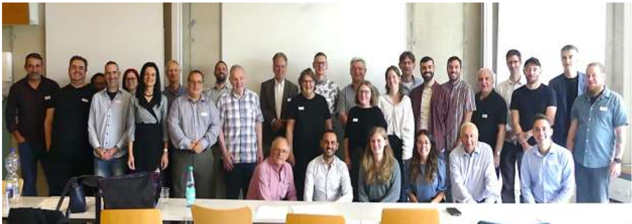
Participants from the 8th Lingwistika Maltija

Linguists from both the Institute of Linguistics and Language Technology and the Department of Maltese at the University of Malta conducted a questionnaire with around 1,200 participants from across Malta and Gozo to capture the differences in vocabulary usage across speakers. The images below, reproduced from malti.mt , a website that shares the findings of this dialect research and other insights into Maltese, illustrate how the Maltese words for 'carrot' vary across localities.