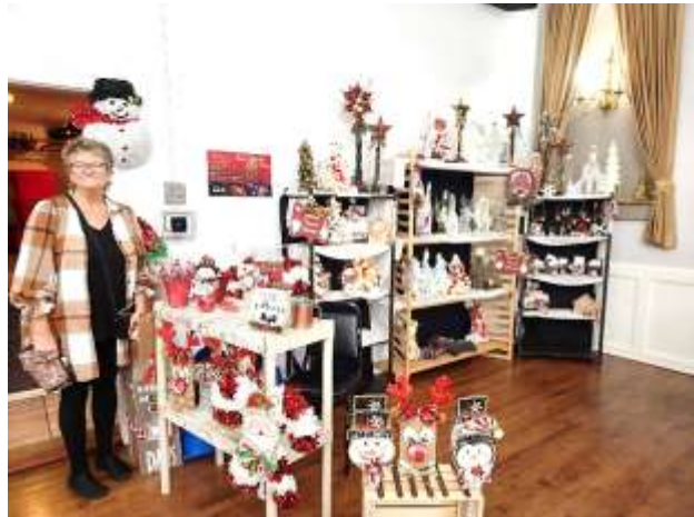
Sisters of the heart

Another successful craft show took place at the Maltese American Community Club of Dearborn (MACC) held on Sunday December 1 st . This year's show was bigger than ever, so much so that it was moved to the hall upstairs to make room for the over 20 crafters selling their goods.