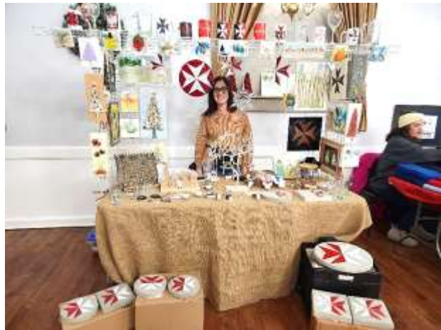
Graceful stained glass