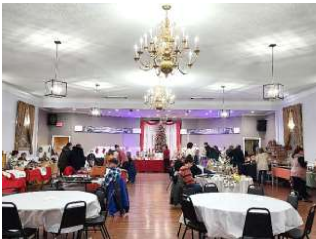
The crafters setting up their tables