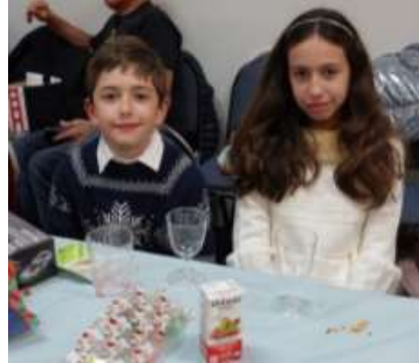
Candid shots of the children