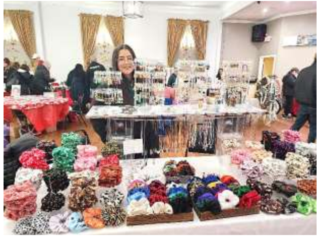
Scrunch Up Your Life