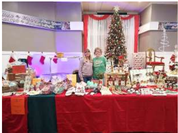
K & K Creative Crafting