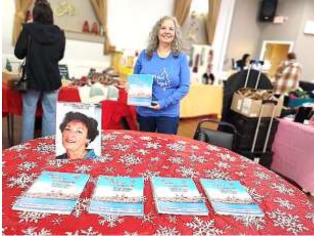
Me with Mom's Maltese Cookbook