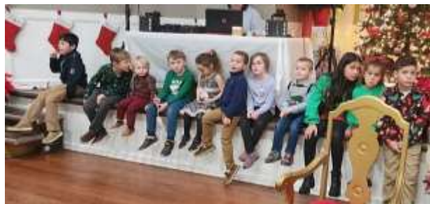
All the kids waiting for Santa