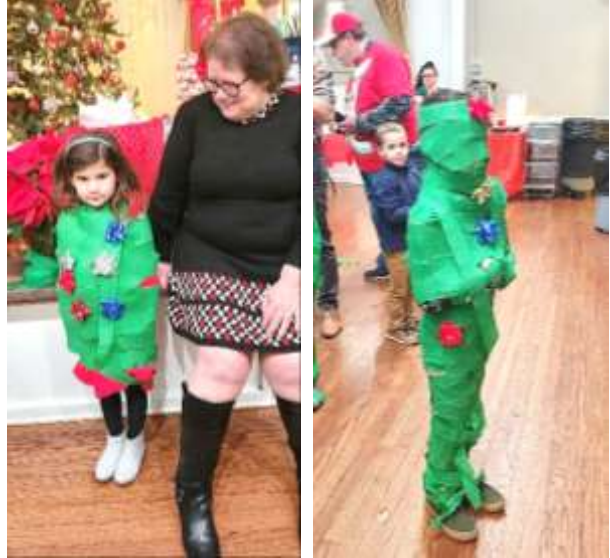
First and second place winners