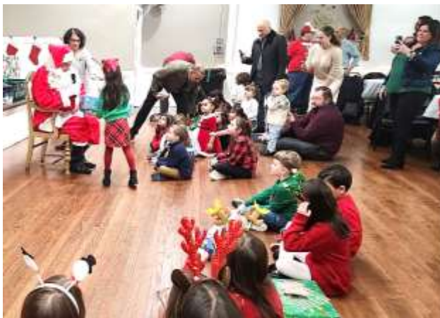
Kids getting their gifts