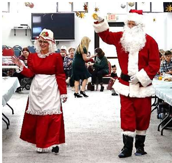
The arrival of Santa & Mrs. Claus