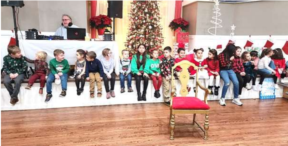
See pages 15-18.