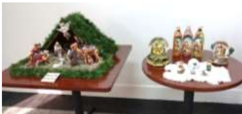
Presepu u pasturi