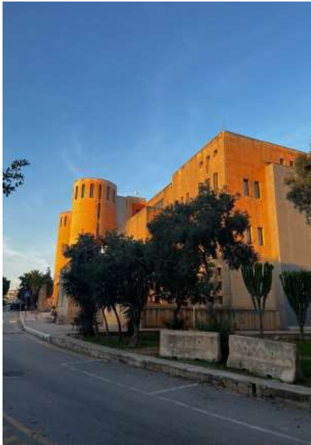
L-Università ta’ Malta

By all metrics, the Maltese language is an intriguing one. With grammatical roots in Arabic and a heavy dosage of Italian vocabulary, Maltese has married the linguistic landscape of the northern and southern coasts of the Mediterranean and, owing to its interesting linguistic history, has become a language with quite unique linguistic structures. It is precisely for this reason that, in 2022, I moved to Malta to pursue a master’s degree in linguistics at the Institute of Linguistics and Language Technology at the University of Malta.