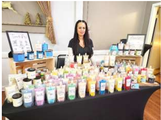
Hooked on a flame