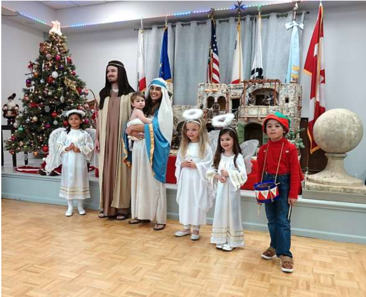
See pages 21-28.