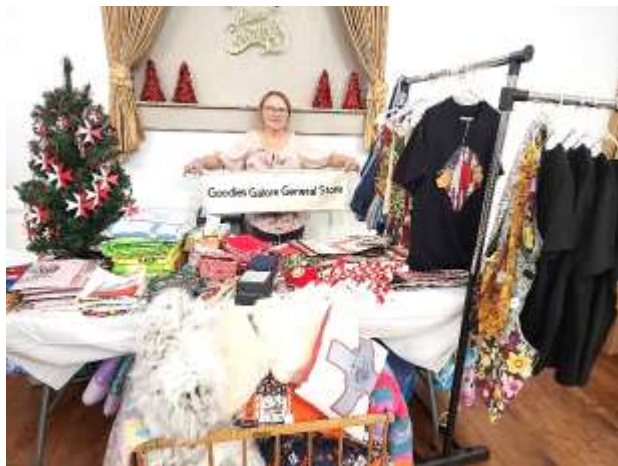
Goodies Galore General Store