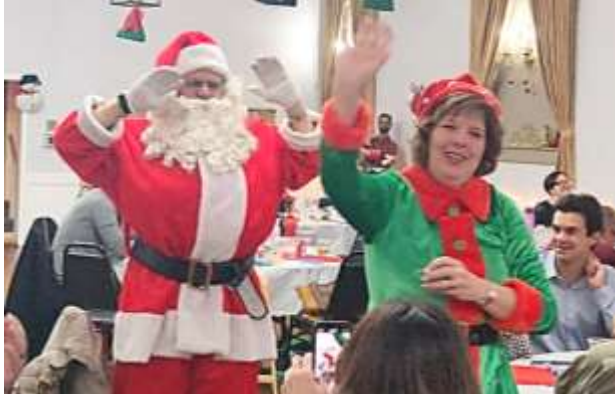
Here comes Santa and his elf