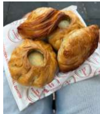
Pastizzi and qassatat

In addition to learning about the Maltese customs and traditions, I also began learning Maltese thanks to the free courses offered through the Department of Maltese at the University of Malta. The Maltese experience was rounded out by visiting each of the Heritage Malta historical sites, like Haġar Qim and Mnajdra, Ġgantija, and the Hypogeum.